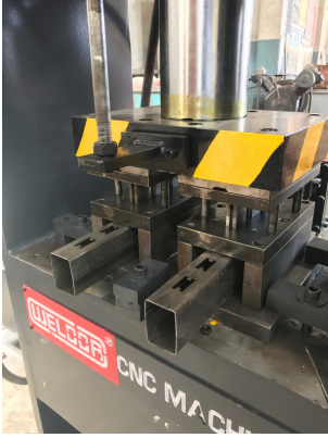
2 Station Option