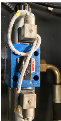
Hydraulics from Rexroth, Germany