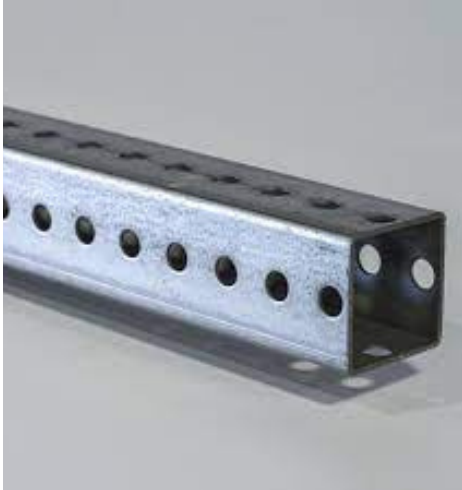
Fences and Furniture