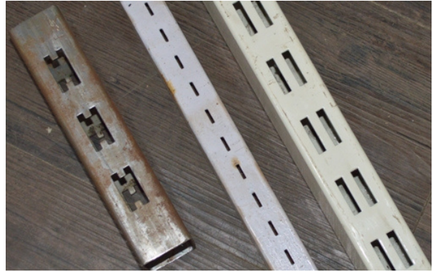
Racks and Shelves