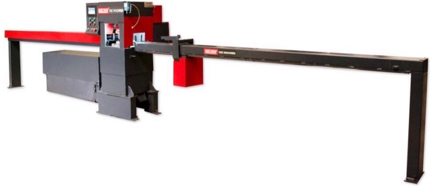
Front Support Table Extension for Longer Profiles